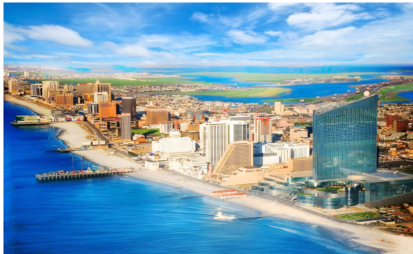
The fabulous Atlantic City beachfront.

We hope that this year's theme, "Communicating the Science of Fisheries Conservation to Diverse Audiences" will stimulate a wide range of sessions encompassing the extensive diversity of fisheries, professionals, disciplines and issues represented within the society. We are encouraging symposia topics, contributed papers and posters encompassing the broad diversity within fisheries that will benefit a range of audiences with the aim of advancing the science of fisheries ecology, conservation, and management. In addition, we hope to develop programming and sessions that will directly engage fishing industry stakeholders on issues of mutual interest and encourage their attendance at the meeting.