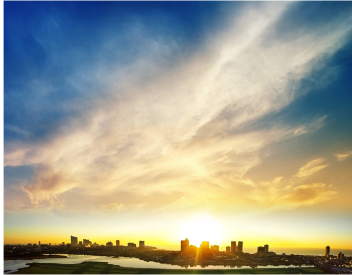
Atlantic City skyline.